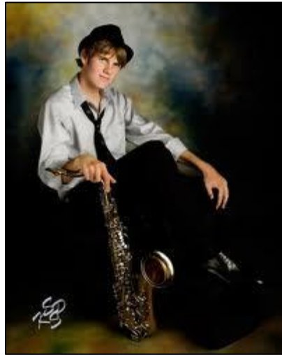
Likely to be Cropped